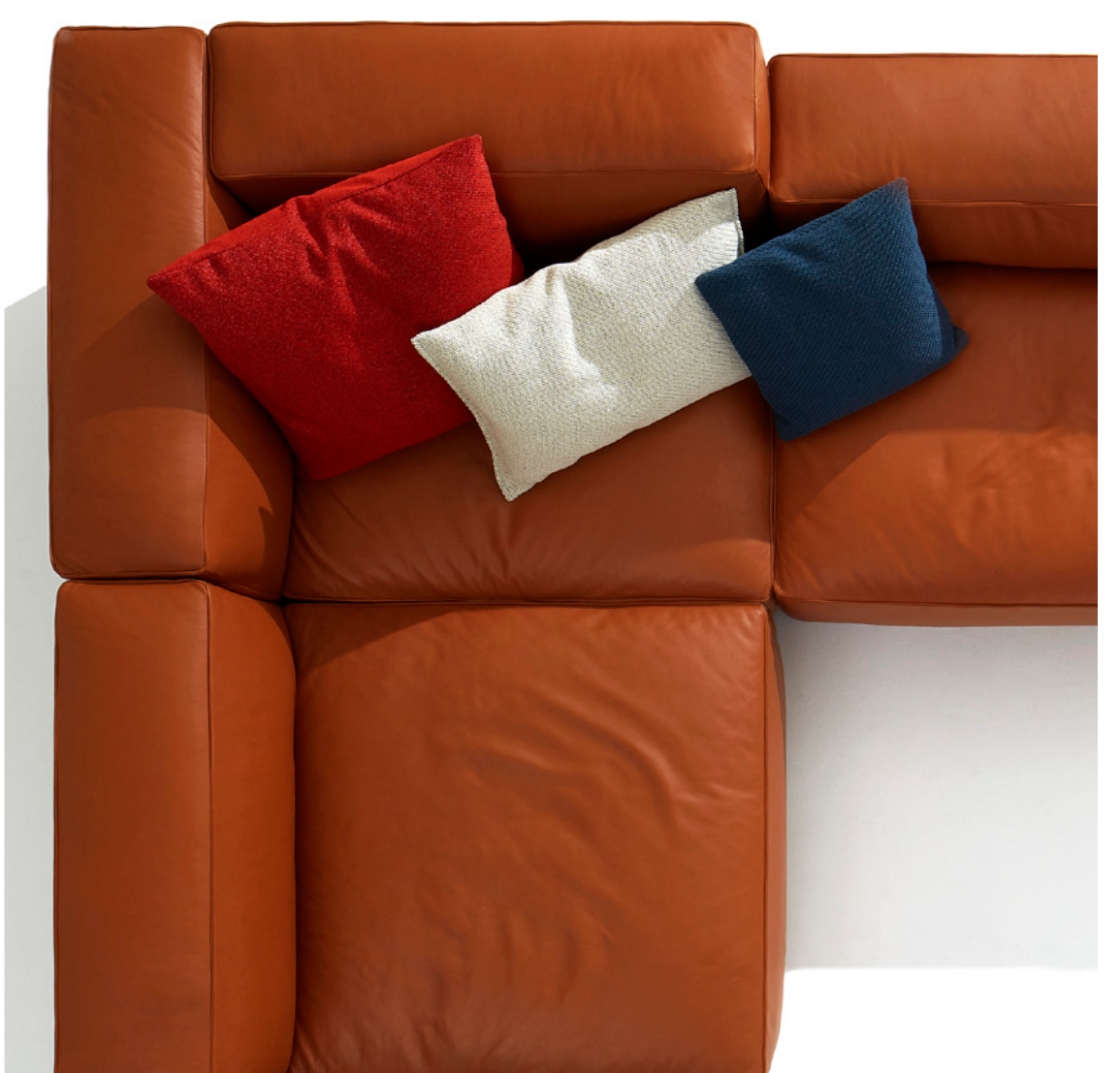
Yoom Soft Lounge

The Yoom Soft lounge collection is defined by its soft, simple forms and unrestricted configurability. Carefully considered proportions and upholstery construction ensure that Yoom Soft offers a highly comfortable sit. Yoom Soft, unlike Yoom, is also offered in leather.