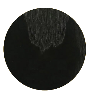
OPAQUE BLACK (87)