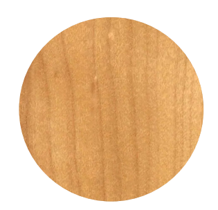
NATURAL MAPLE (83)