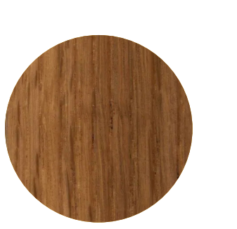
WHITE OAK (81)