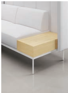
SMALL SIDE TABLE 15x29