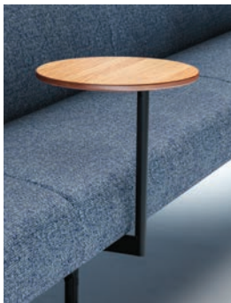
TABLET ARM UNDERMOUNT