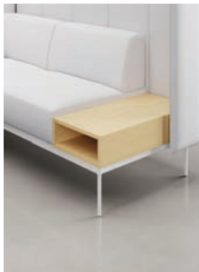
SMALL SIDE TABLE (WITH SHELF) 15x29