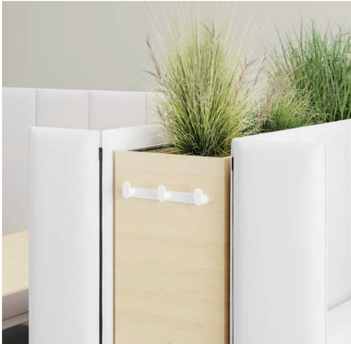
PLANTERS (OPTIONAL COAT HOOK)