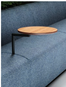
TABLET ARM SEAT MOUNT