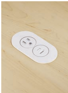
SURFACE MOUNT POWER