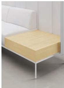
LARGE SIDE TABLE 30x29