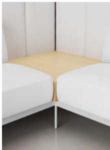
CORNER TABLE 30x30