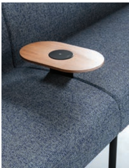
WIRELESS CHARGING TRAY